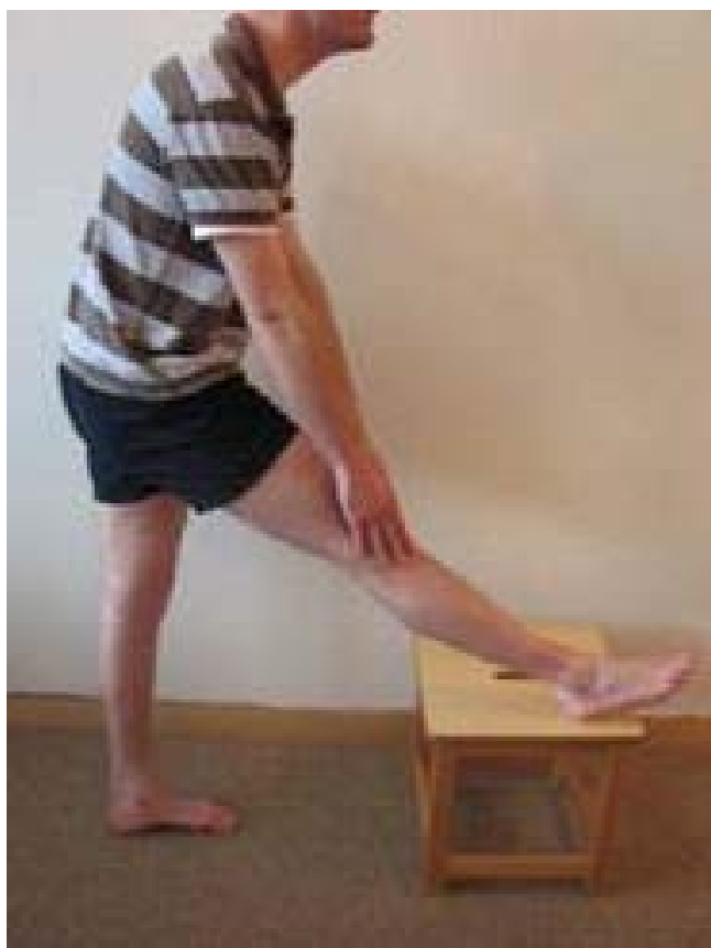
Figure 3 Static stretch. Participants placed their leg on an elevated surface with their knee extended and their ankle in plantar flexion. Each participant was then instructed to lean forward from the hip, with their spine in neutral until a stretch was felt in the posterior thigh. This position was held for 30 seconds, and repeated 3 times.